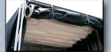
Optional rope and pulley rear flap